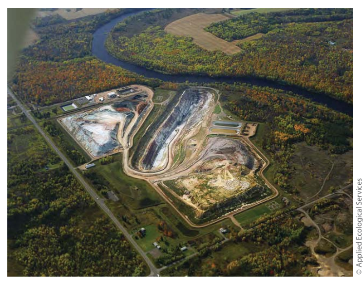
▲ Flambeau mine, 1996: Production at the Flambeau mine began in 1993. The mine produced 1.9 million tons of high-grade copper ore—yielding 181,000 tons of copper, 3.3 million ounces of silver, and 334,000 ounces of gold—before it was closed in 1997.

Two Michigan deposits (Copperwood and the Back Forty) are included on the map. Both are relatively large tonnage, nonferrous sulfide deposits. Copperwood has just begun the formal state permitting process; the Back Forty is scheduled to apply for a mining permit early in 2012. If these deposits are permitted and become mines, they will likely include ore processing infrastructure (such as a mill) whose proximity to northern Wisconsin sulfide deposits may well make those deposits more economically viable.