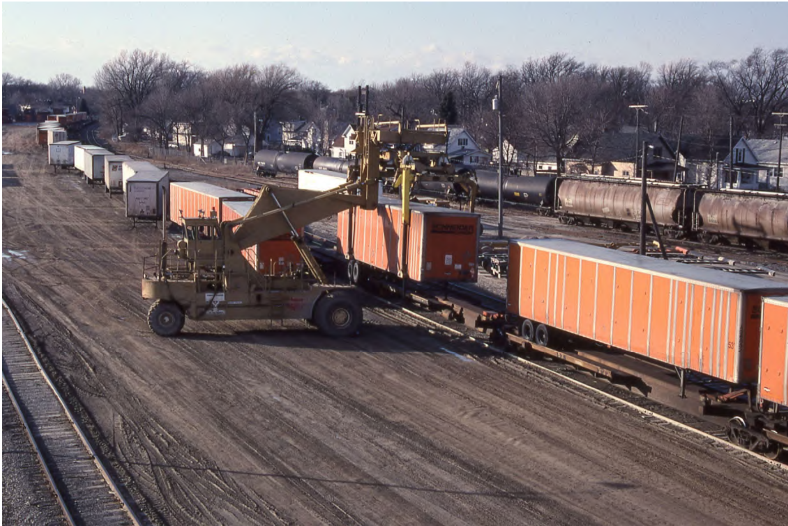
Green Bay, WC Ashland Ave. Yard