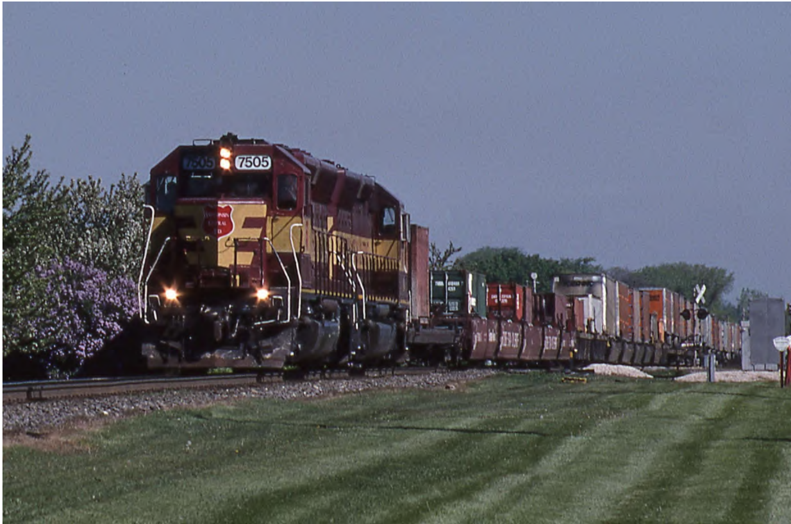
WC Locomotive 7505, Linehaul Schneider TOFCs & Overseas COFCs