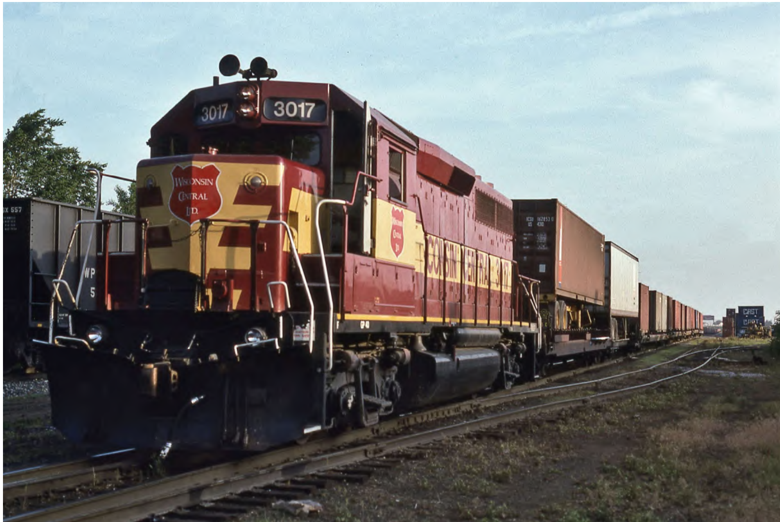
WC Locomotive 3017 Departing a Yard