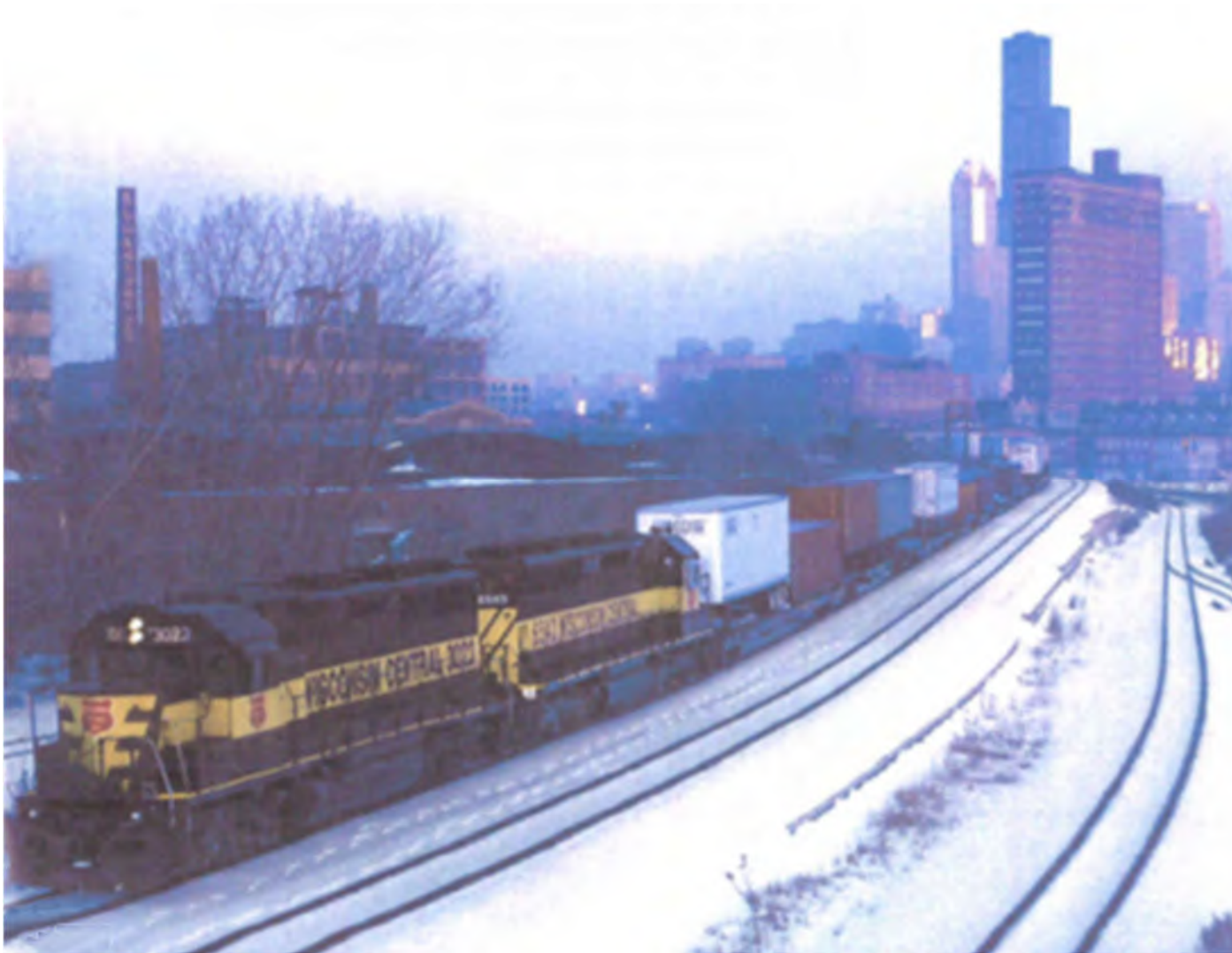
Chicago WCT Company, 1994 Annual Report Cover Page TOFC, COFC, Domestic & Overseas